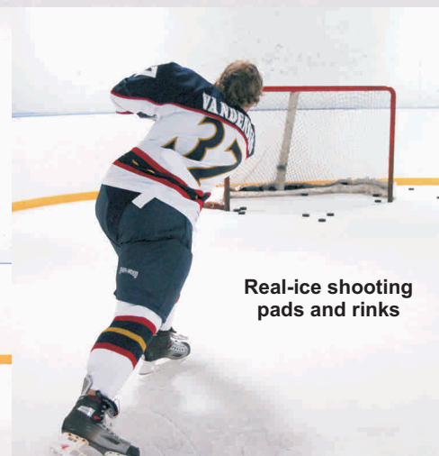
Real-ice shooting pads and rinks