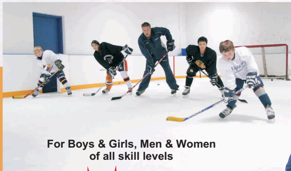
For Boys & Girls, Men & Women of all skill levels